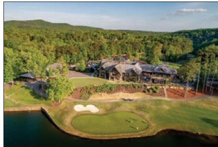
Golf Lawn of Clubhouse