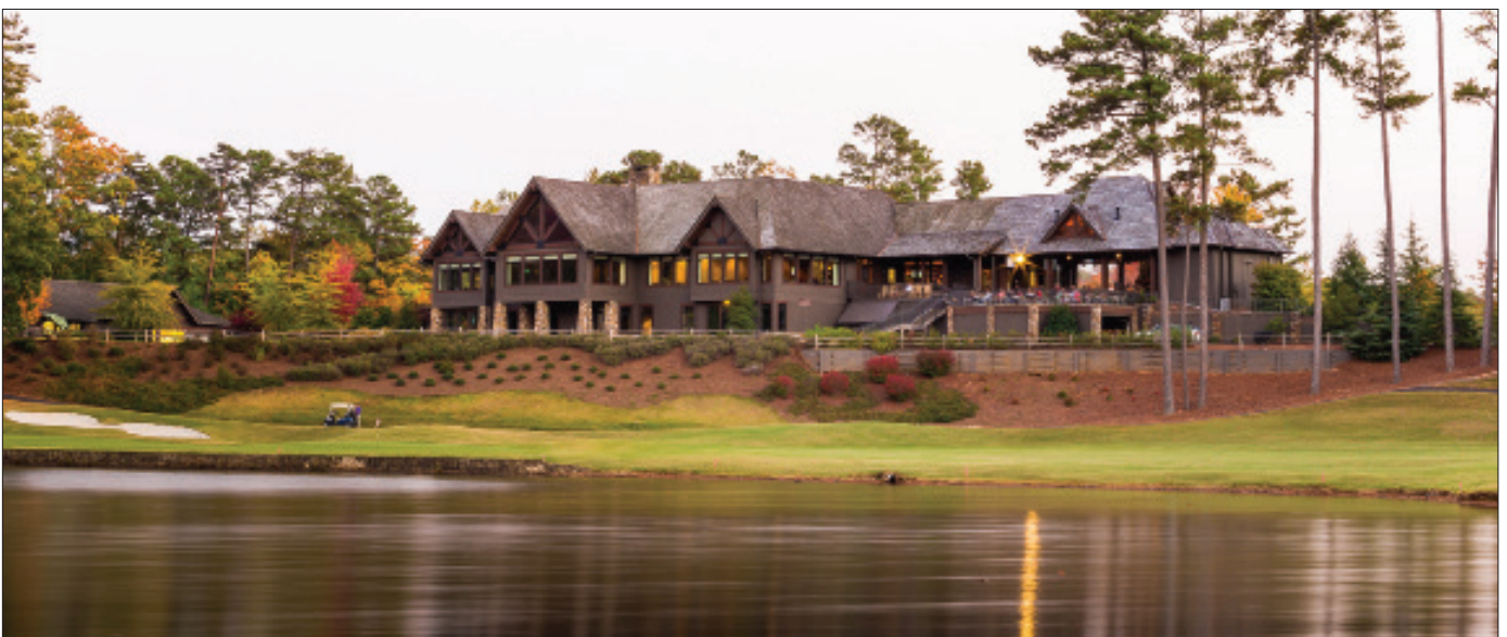
Entire Clubhouse (excludes Pub*)