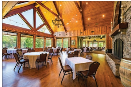
Mountains Grille Room & Sconti Room