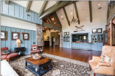
Mountains Grille Room (includes Gathering Area)