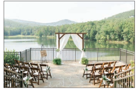
Sunset Veranda and Patio

The Clubhouse at Lake Sconti is happy to accommodate your ceremony and/or reception on-site. Our Sunset Veranda has a beautiful view of Lake Sconti, is partially covered, and has drop down screens if needed for inclement weather. The Veranda has heaters for the winter, and fans for the summer. There are additional rooms and options on both levels of the facility to customize your special day. We are happy to host ceremonies only or both your ceremony and reception.