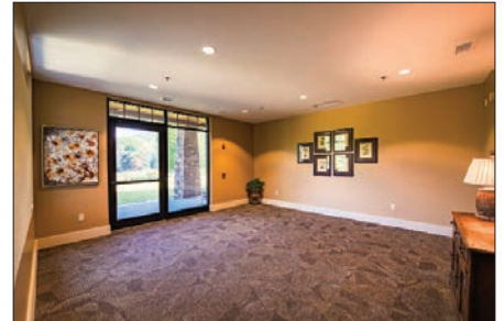
Card Room & Clubroom