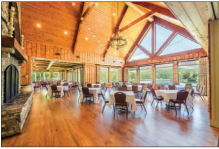
Clubhouse Main Level (excludes Pub & MDR)

The Clubhouse at Lake Sconti is happy to accommodate your ceremony and/or reception on-site. Our Sunset Veranda has a beautiful view of Lake Sconti, is partially covered, and has drop down screens if needed for inclement weather. The Veranda has heaters for the winter, and fans for the summer. There are additional rooms and options on both levels of the facility to customize your special day. We are happy to host ceremonies only or both your ceremony and reception.